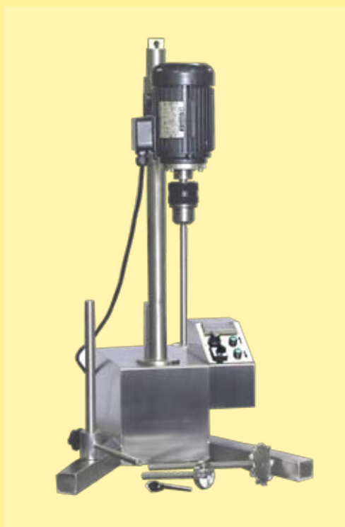
shaft and mixer heads:

Mixer with motorized system to move head up and down - type MSM-S-B: