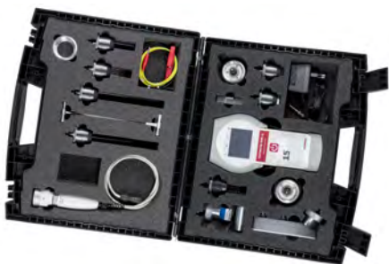
Fully loaded accessories case (example)

The user selects the most common types of fibres and their composition via the touchscreen. The mixing ratio can be adjusted in 5% increments. The measured values can be stored in separate memory banks and thus divided into different categories (e.g. different types of fabric). An integrated USB interface facilitates transfer of the stored data to a PC.