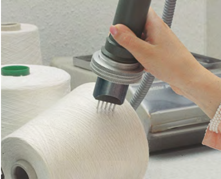
Moisture measurement on bobbins

There is a physical relationship between the moisture content and electric conductivity of hygroscopic materials. It follows a specific curve for each type of material. The Textometer DMB has therefore stored calibration curves of different materials. The matching calibration data is automatically preset by the choice of fibre type or mix of fibre types. The device is immediately ready for use.