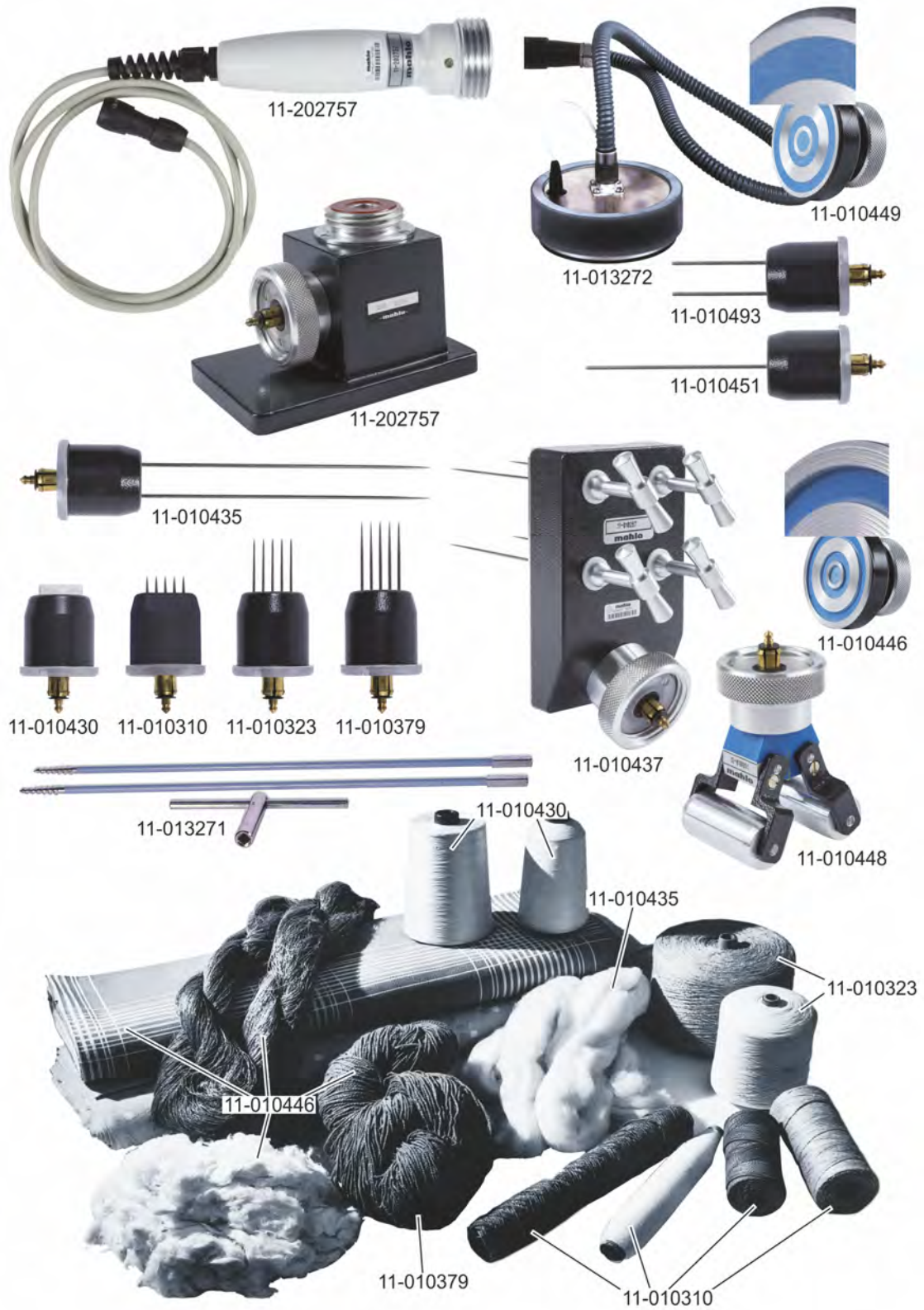
Textometer DMB accessories and fibre types