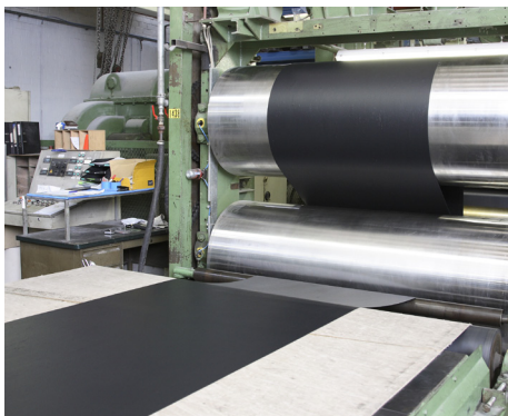
Extruding of rubber