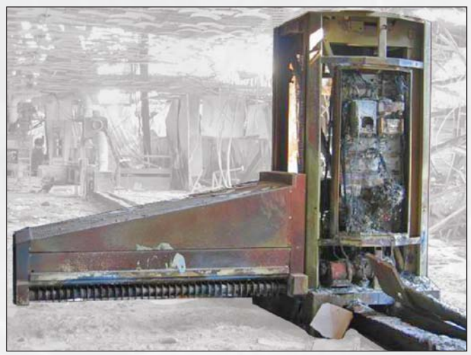
Bale Opener Without Fire Protection